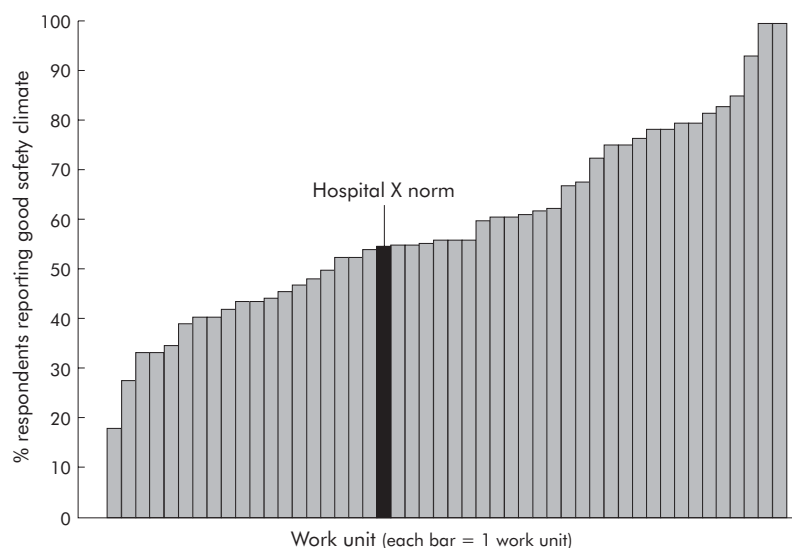
Figure 2 Safety climate across 49 work units in one hospital.

climate) and measure the entire hospital annually; this has already been done at the Johns Hopkins Hospital. We found that when you measure and feedback data in one work unit, other units quickly desire their own cultural assessment as well. The Safety Attitudes Questionnaire is the most widely used cultural assessment tool in health care to date. In the past 12 months we have assessed culture in over 100 hospitals with an average hospital-wide response rate of over 80%. Representativeness is critical as it makes the data easy to interpret and difficult to ignore. This is particularly true in pre-post or longitudinal cultural assessments where high response rates are essential to interpreting data over time. When response rates fall below 60%, the data represent opinions rather than culture