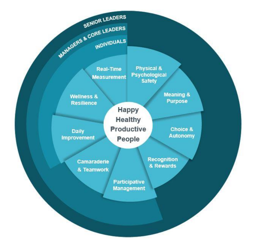
Figure 2. IHI Framework for Improving Joy in Work