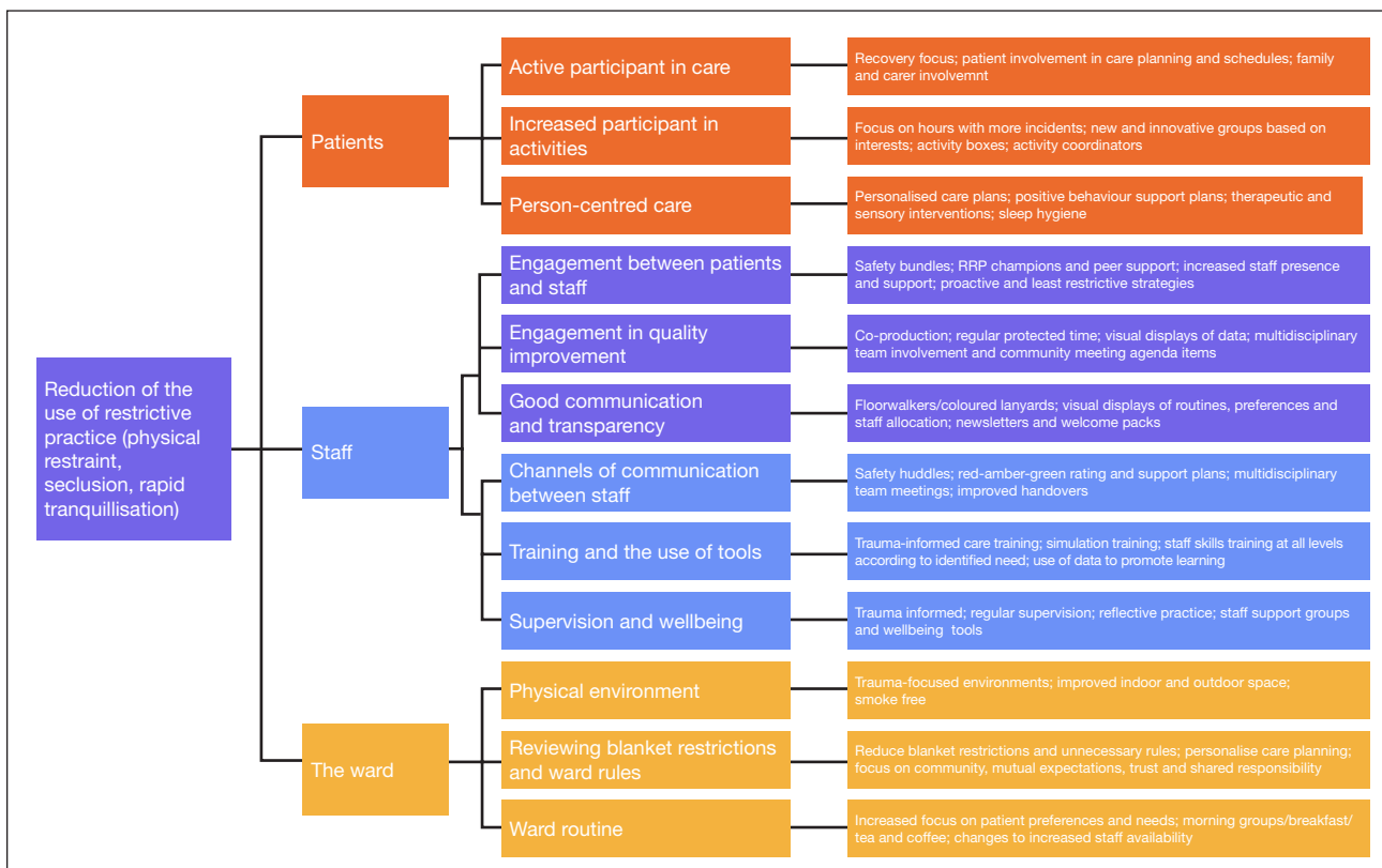
Figure 3. Theory of change provided to teams taking part in the reducing restrictive practice (RRP) programme, which brought together existing knowledge and ideas on the topic. Adapted with the kind permission of the Royal College of Psychiatrists (2021).

All teams taking part in the improvement collaborative were supported by a trained improvement coach, who facilitated team meetings and workshops to provide support with quality improvement methods and tools. The teams were given access to a rich set of resources at the start of the programme, developed by the design group and consisting of a theory of change with ideas, innovation and an evidence-base that the team could use in their own work (Figure 3). Critical to the success of the programme was a central programme team that consisted of four quality improvement coaches and a programme manager who had experience in improvement to guide the design and delivery of the learning system.