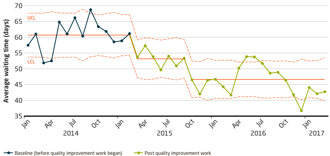
Figure 2 Average waiting time from referral to first face-to-face appointment, 2014–17 (ELFT)