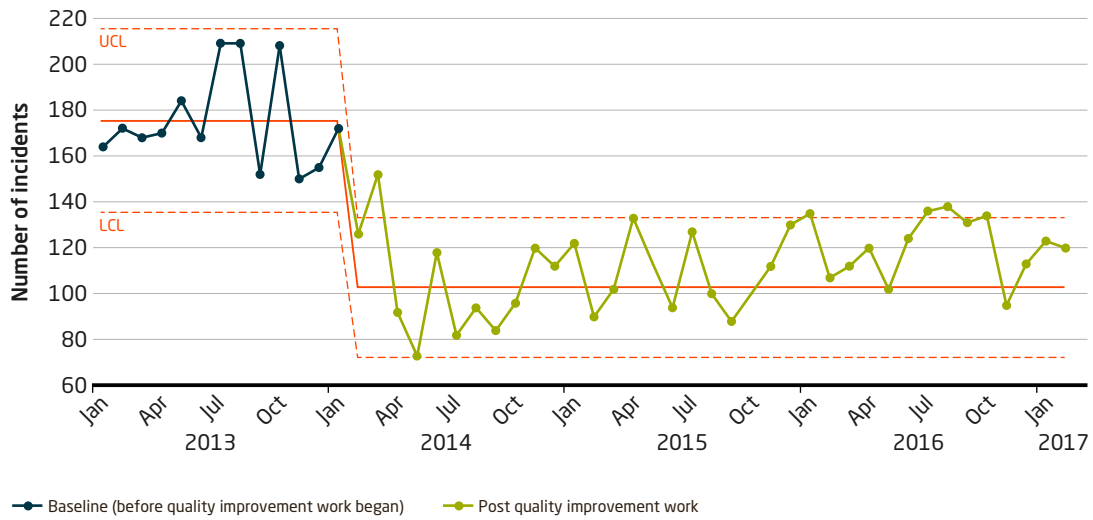
Figure 1 Incidents resulting in physical violence, 2013–17 (ELFT excluding Luton and Bedfordshire)